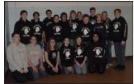
Members of the Science Olympiad team competed in March and earned a trip to the state competition in April, where they place 11th overall.